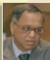
Narayana Murthy Infosys Technologies Ltd Chairman (referring to the ICT for All theme)

“ Unless we can bring ICT to the most remote corners of Malaysia, we will not reap its benefits... It's a great message for all developing countries. ”