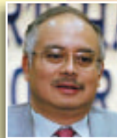
Datuk Seri Najib Tun Razak Deputy Prime Minister

“We need to teach schoolchildren about the value of ICT to usher in a new generation of ICT-savvy Malaysians. Only then would you see exponential growth in its use.”