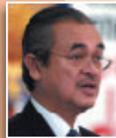
Prime Minister Datuk Seri Abdullah Ahmad Badawi

“The MSC had to become the preferred ICT hub. This could be done by ensuring that its workforce, products and services were of high quality.”